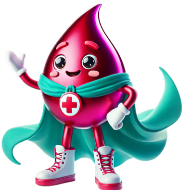
BARRY THE BLOOD DROP