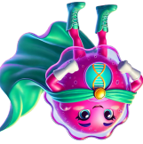
STELLA THE STEM CELL

STRENGTH: 8 SPEED: 8 SKILL: 10 TEAMWORK: 9