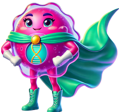
STELLA THE STEM CELL