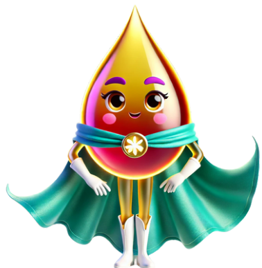
POLLY THE PLASMA