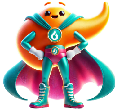
PERCY THE PANCREAS #05 SUGAR BOSS