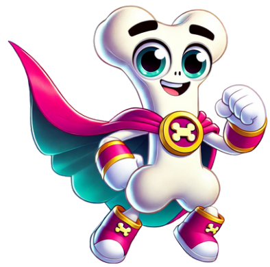
BENNY THE BONE #08 STRENGTH MASTER