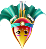
POLLY THE PLASMA

STRENGTH: 7 SPEED: 9 SKILL: 9 TEAMWORK: 10