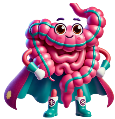
IZZY THE INTESTINES #07 FOOD FUELER