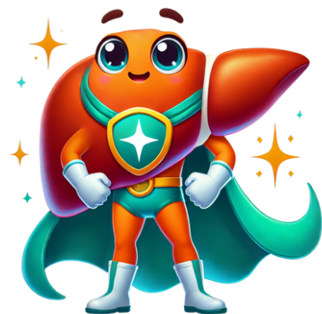
LARRY THE LIVER #06 THE GREAT CLEANER