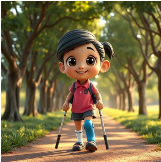
Splint or Cast – Keeps a broken bone still while it heals.