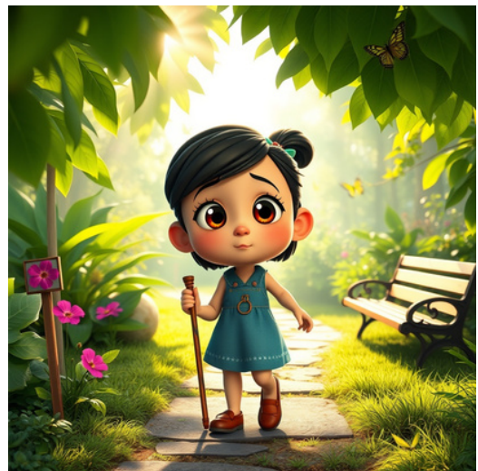
Walking Stick (Cane) – Helps with balance and walking.