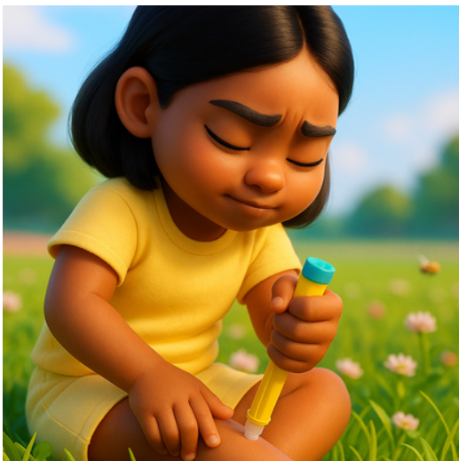
EpiPen – A special pen-like device that gives medicine very quickly to someone having a severe allergic reaction.