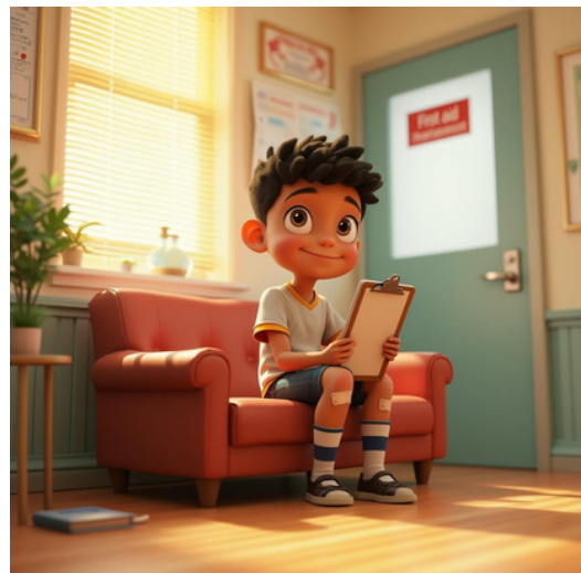
Band-Aids – Sticky strips that cover small cuts or scrapes to keep germs out and help your skin heal