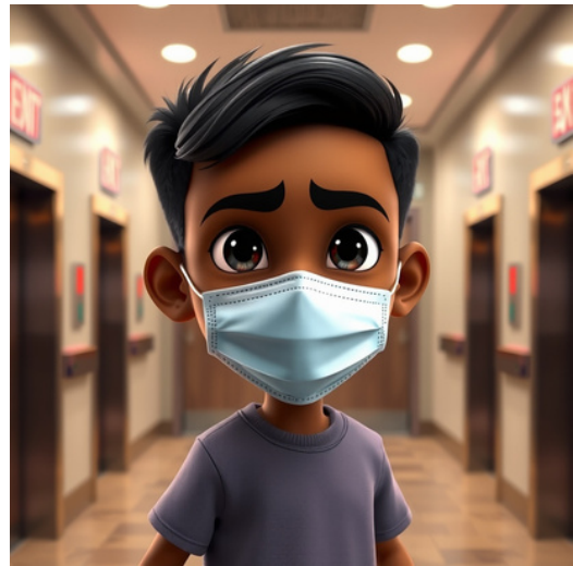
Face Mask – Protects against germs or dust.