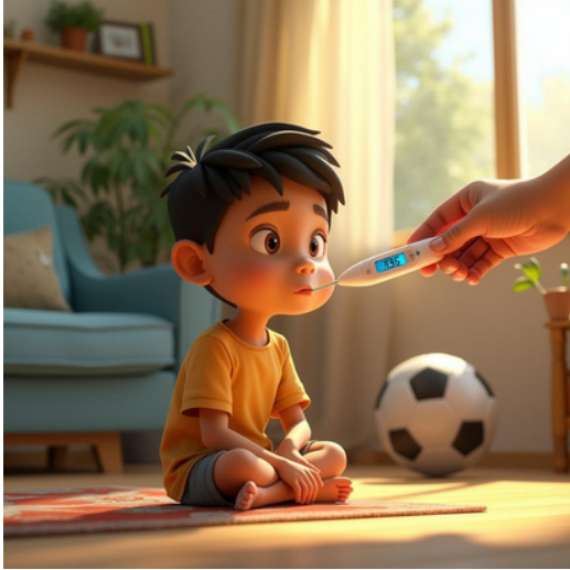
Thermometer – Used to measure body temperature