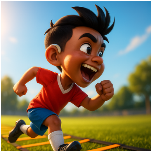
Hearing Aids – Small devices that help people hear better.