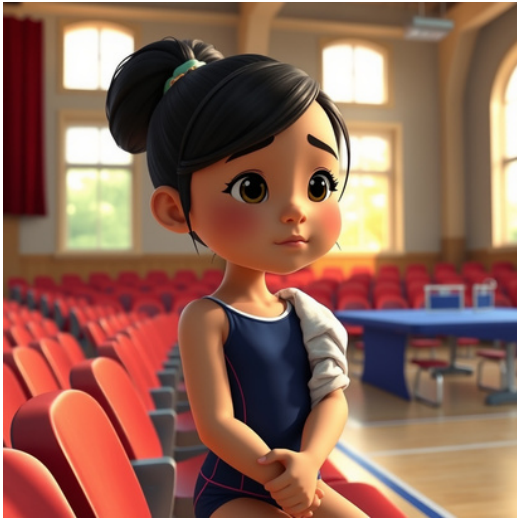
Hot Water Bottle / Heat Pack – Helps soothe aches and pains.