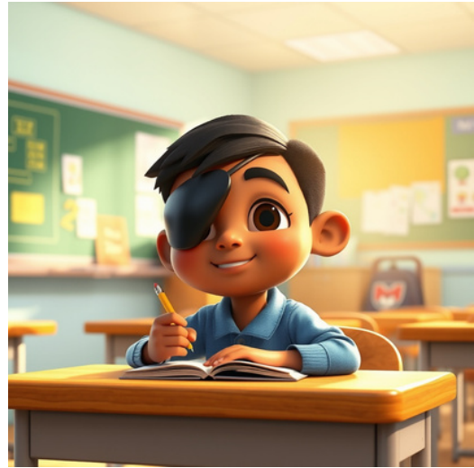
Eyepatch – Protects an injured eye or helps strengthen the weaker eye