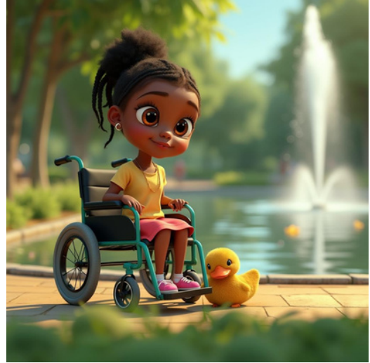
Wheelchair – Helps people who can't walk or have difficulty walking