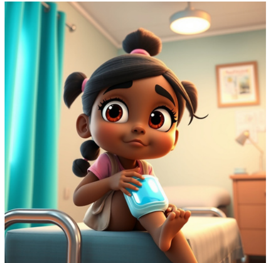
Ice Pack – Used to reduce swelling or pain after an injury.